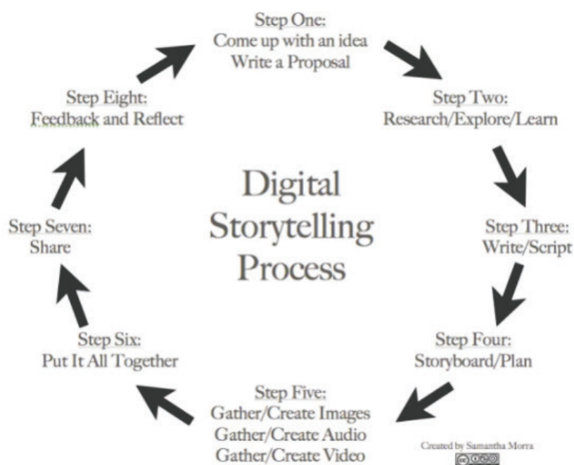
Figure 2: Digital Storytelling Process (Morra, 2014)

The process of digital storytelling can, according to Samantha Morra, be summed up as an eight step process. The first step begins with an idea, which is the first concrete step to creating a digital story. This can be done in various forms; a proposal, a mindmap, etc. The second step is to research, explore, and learn, essentially to build up a wealth of knowledge on their interested topic from which they can draw upon when crafting their story. The third step is to write, or to create a script – an outline of the story. It's the stage where details like which tense to write from, or whether first, second, or third person perspective will be used. The fourth step is to create a storyboard, where the script will be translated into a visual media plan, incorporating the use of audio and visuals into the plan. The fifth step is to begin gathering the necessary visuals from the plan in step four. Step six is to combine all of these elements together, with step seven being to share your digital story, which leads into the final and eighth step, step eight, whereby feedback is received that can be used to reflect upon the created piece.