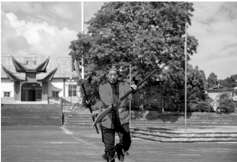
Fig 1: Charming sports of Yunnan province

The people from various ethnic groups in Yunnan province demonstrated the charm of their traditional sports recently (Fig 1 and 2).