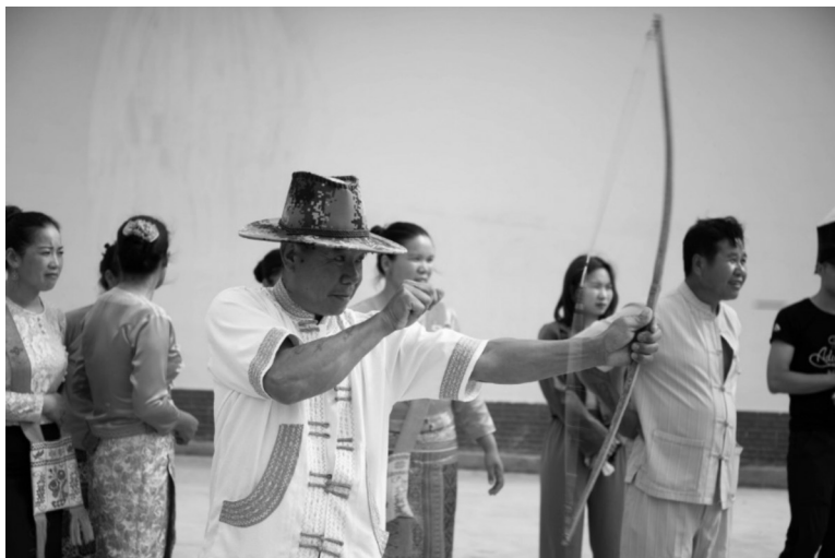
Fig 2: Yunnan ethnic group shots a ball with a traditional bow made solely of bamboo https://www.chinadaily.com.cn/a/202006/02/WS5ed60af5a310a8b24115a502.html